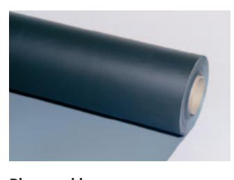
Rhepanol hg. Roof sealing and root penetration protection in one single membrane.

What is so special about Rhepanol hg? Well it is designed to meet the criteria laid out in the FLL Guideline for resistance to root penetration. As to its ingredients, this roofing membrane is also based on the long-term proven material polyisobutylene (PIB), as has already been the case with Rhepanol fk for 30 years. The difference, however, why progressing and even persistently boring root systems will despair of Rhepanol hg , lies elsewhere. Rhepanol hg is optimised in terms of resistance to root penetration and hot air welding characteristics. That is why the seams are also absolutely resistant to root penetration without any further sealing. And this is exactly what the "h" stands for in the name. The "g" means the stabilisation of the roofing membrane by the central glass fleece reinforcement.