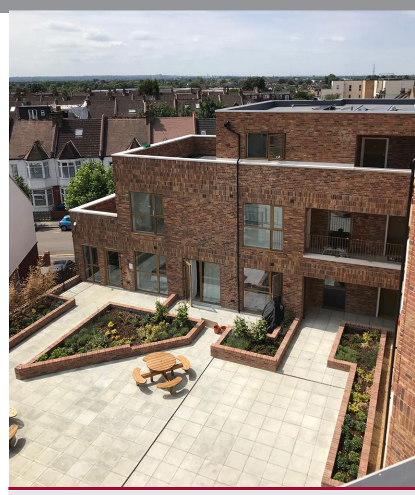
IKO Permatec was specified for the terraced courtyard and overlaid with pedestals and paving slabs.

IKO Permatec was chosen for its flexibility, strength and self-sealing properties. The characteristics of the membrane make it ideal for use on podium decks with concrete substrate and