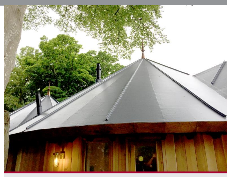
A single ply membrane with excellent sustainable credentials plus the added benefits of the seam profiles justified switching to a more contemporary material, Armourplan P single ply.

The installation took four weeks which, for such a small roof, maybe considered a long time. However, the complexity of the multi-faceting, sloping interfaces and steepness of pitch needed a slow and steady approach and the correct sequencing of works in order to ensure the best possible outcome for this stunning holiday home design.