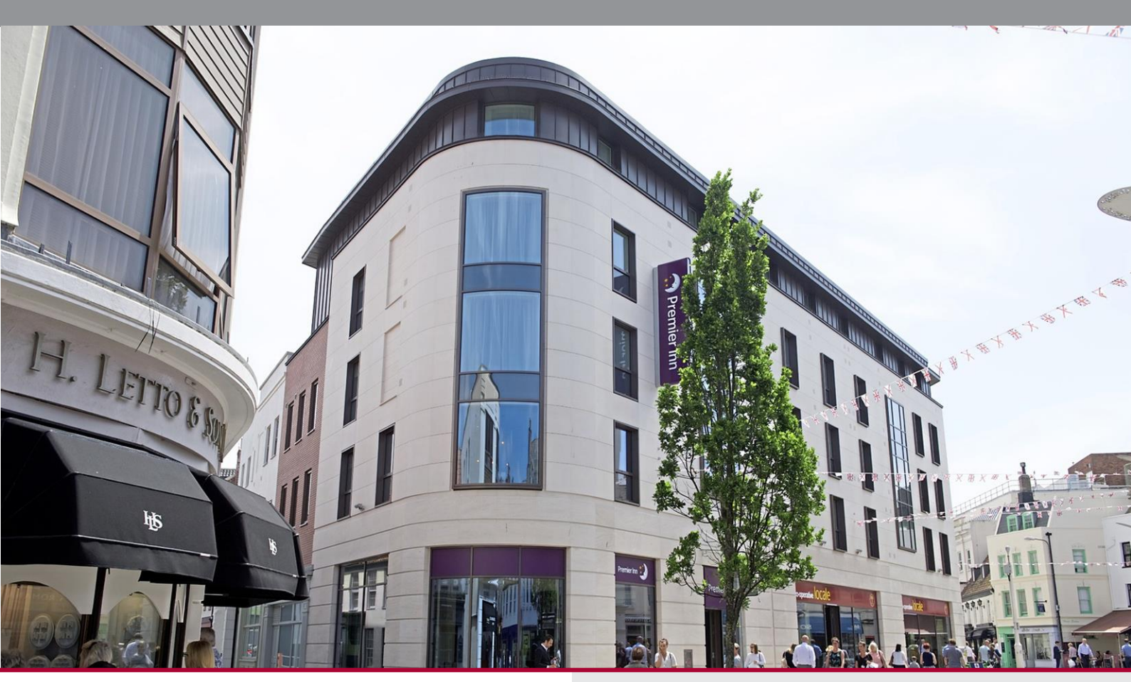
The four storey 91 room Premier Inn hotel is situated at the busy Charing Cross interchange in St Helier Jersey and features some distinctive external cladding in addition to well through-out roof design.