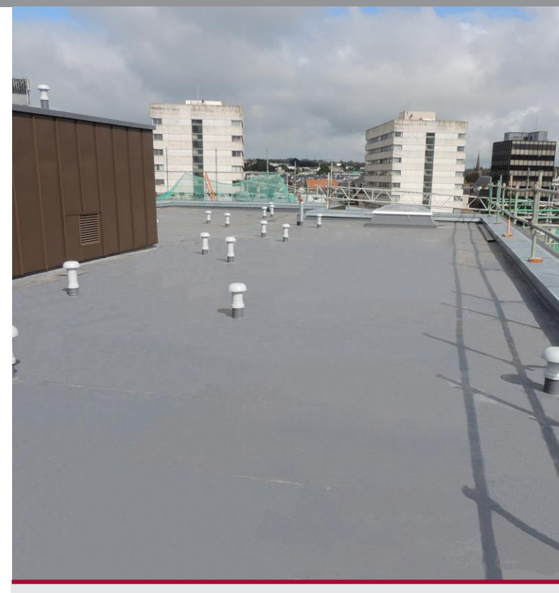
Armourplan PSG system was chosen to waterproof 800 \,\mbox{m}^2 of the main roof area.

A key feature of the Premier Inn is the 80 m² green roof which is overlooked by the hotel's restaurant. The sedum green roof was installed over FDT's Rhenofol CGv single ply membrane waterproofing and a concrete deck. Rhenofol CGv has been tested to meet FLL standards and is resistant to roots and rhizome penetration. All flat roofing elements were installed by SIG Design & Technology's DATAC accredited contractor, KA Bailey of Jersey.