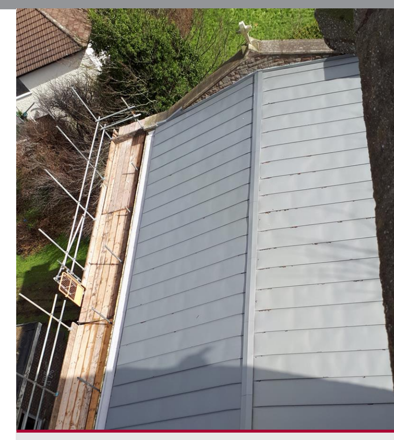
A zinc coating, elZinc Slate, was chosen to create a 'like-for-like' finish on the pitched roof.

The variety specified was elZinc Slate, which is matt grey and closely resembles lead, or naturally weathered zinc. A lead batten roll was most commonly used on church roofs built in the same era as St Andrew's.