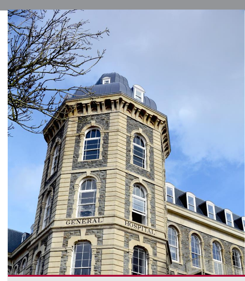
City & Country were granted planning permission on the condition they could recreate a key feature of the Bristol General, the distinctive Ogee Dome

Although Roofworx had had experience of using Armourplan on flatter roof structures, they had not then employed it on a project with complex radii such as the Bristol General. However, due to their skills, a planned approach and the versatility of the product, they were confident it would work well.