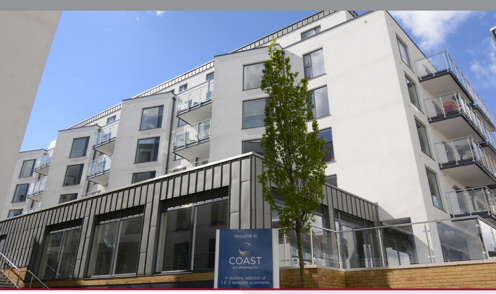
The new development of luxury flats in Bournemouth know as 'Coast', is the first use of elZinc Slate Advance in the UK.