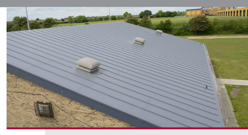
The swimming pool waterproofed with Armourplan PSG standing

The roof deck to the 900m<sup>2</sup> Gym Hall & Changing Rooms was deemed fragile and to contain asbestos. Dufell who are licensed handlers of asbestos removed the deck using correct H & S methods. The roof was then completely refurbished with the SIGnature bituminous torchon system comprising vapour control layer (VCL), Cut-To-Falls insulation together with SIGnature 25 underlay and cap sheet which were installed over a new timber deck.