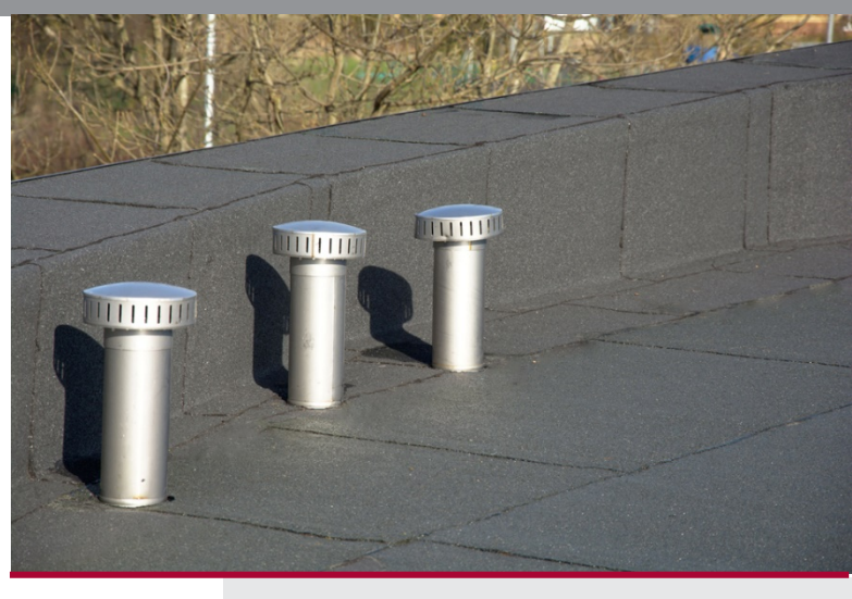
A crucial phase of the work was the correct detailing of the junctions with the flat roof.

"Good tradespeople come up with good solutions," says Ian Dryden, who praised the time and care that went into the detailing. Thanks to the craftsmanship of the contractor, the repairs were completed over the summer holidays in an aesthetically pleasing manner that came in under budget and – importantly - fully warranteed.