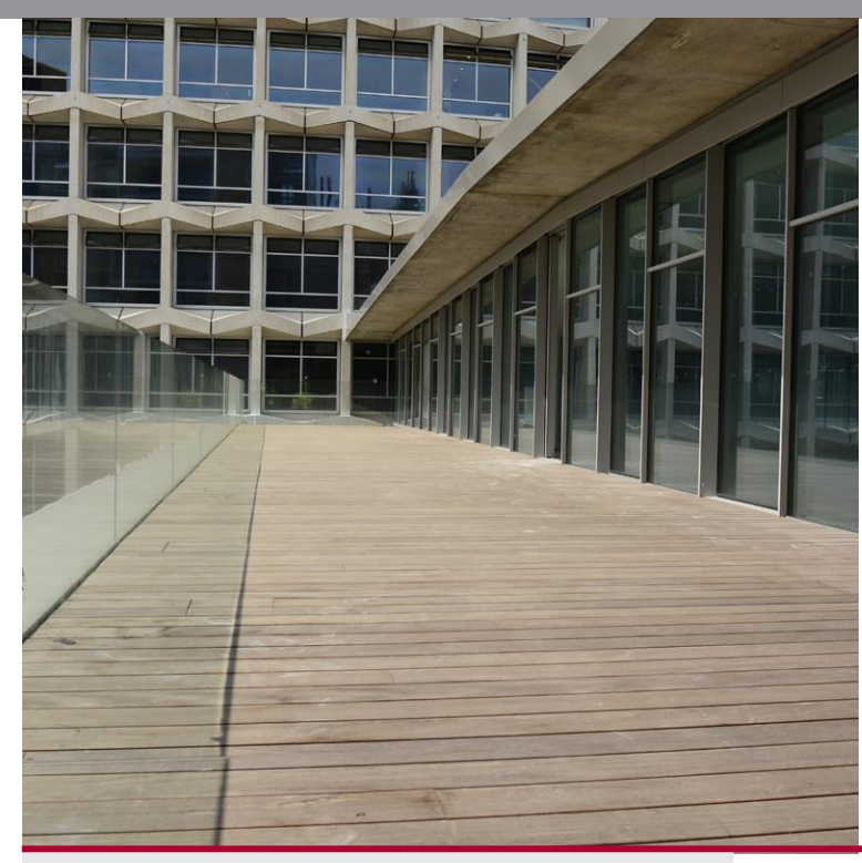
SIG brought its technical expertise at the base of the tower, which is now in use for retail and residential purposes.

Its rapid curing property helped speed up the refurbishment process while facilitating the overall programme of works for following trades.