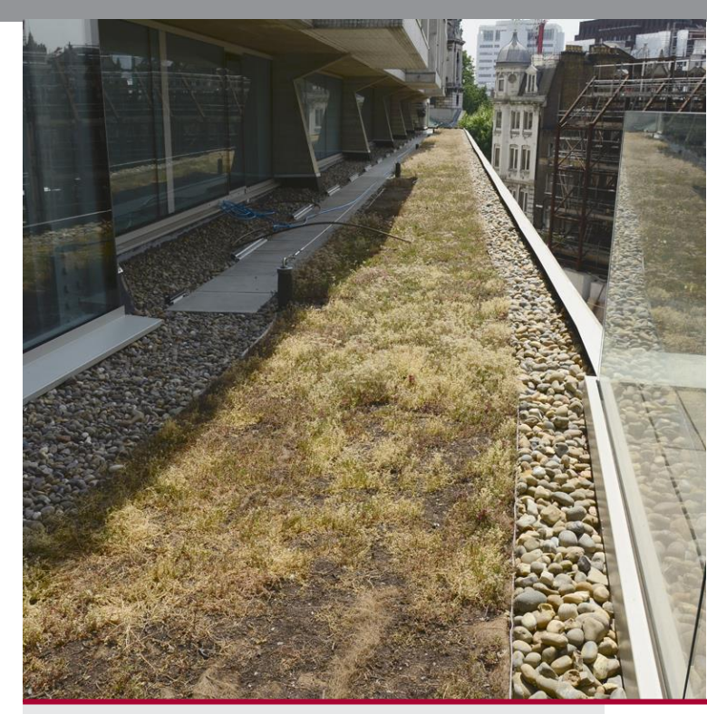
Both green roofs were installed adjacent to each other on the south side of Centre Point House

"Not only did the waterproofing systems we specified need to be versatile and work with different areas of the Centre Point building envelope but meeting aesthetic demands at this Grade II Listed building was also an important element of the client brief.