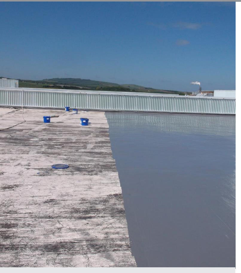
The quick installation process, by roller in a single application, meant the AH-25 could be installed in just two weeks.

pass install and no additional respiratory PPE needs to be worn at installation.