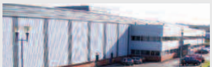
Spectraplan factory, Chesterfield